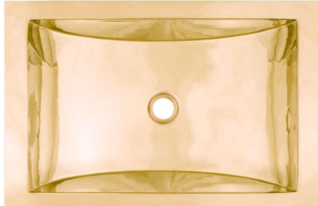
Shown in PB