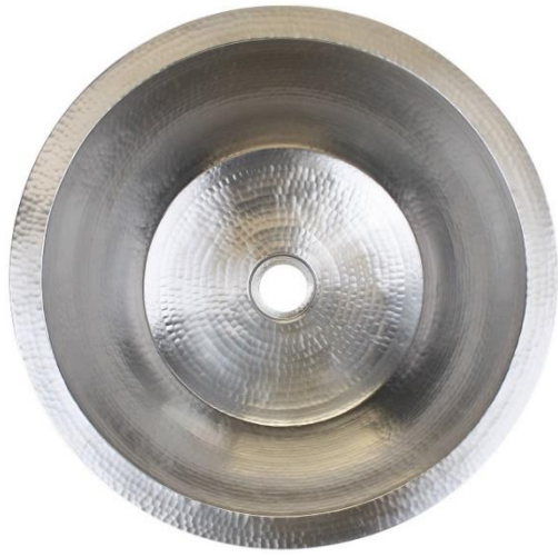
Shown in SN